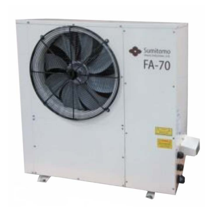
Air cooling unit

The control system gives the user all the information necessary to ensure an efficient and consistant supply of Liquid Nitrogen and nitrogen gas are always available. From the process to flow and alarms, including automatic operation, Trend graphs, service alarm and service records page, there is simply no other Liquid Nitrogen System.